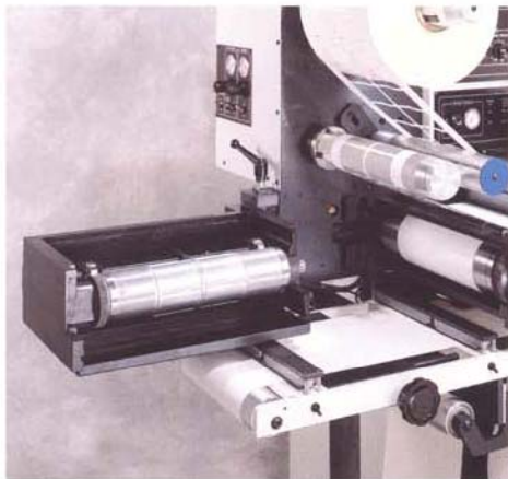
Die Module Stowed Position

Founded on Arpeco's experience serving the label industry.