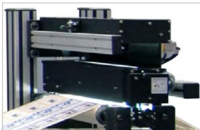
100% Vision Inspection