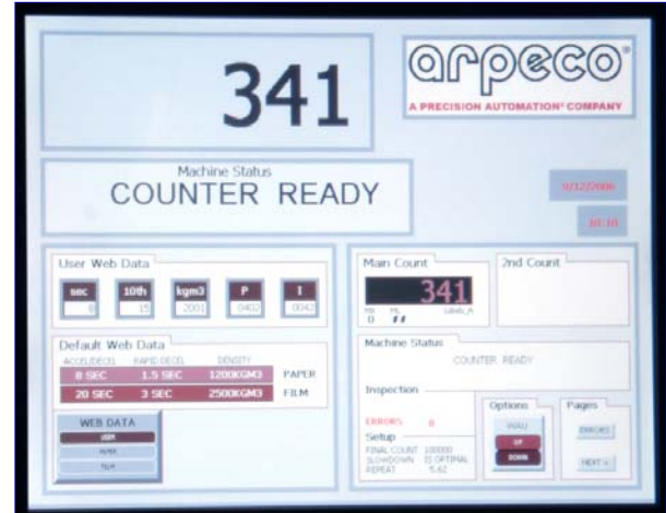
305mm (12") Color Touchscreen