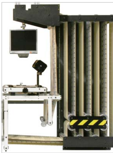
Patented Shuttle Retrieval System with Web Guide & Vision Position