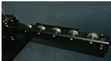
Ball bearings for easy handling